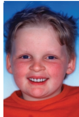
Figure IV. Patient with implant.