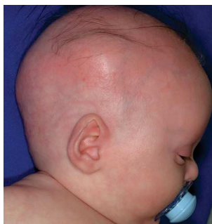
Figure II. Diffuse alopecia, erythema and scaling of scalp