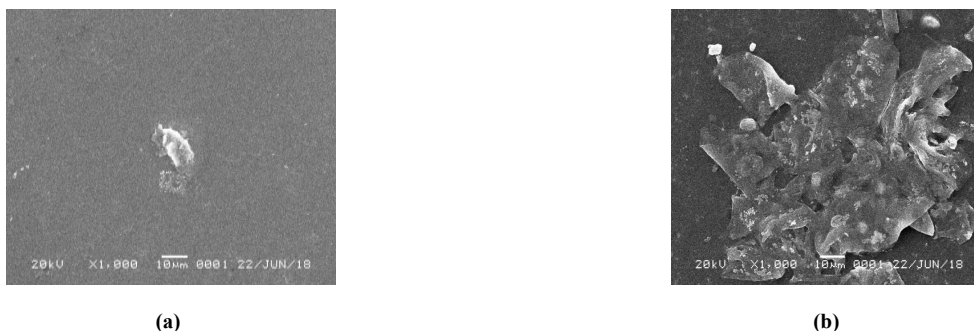
Figure 2: Scanning electron microscopy image of polystyrene plastic film surface, (a) before biodegradation test, (b) after biodegradation test using bacterial isolates obtained from the soil of Jayawijaya Mountains, Papua in Agar Nutrient medium

appearance of brittleness on plastic film sheets on testing sheets with bacterial culture 15 .