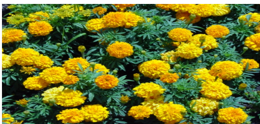
Figure 1; Tagetes erecta

These marigolds are the sterile hybrids of tall African and dwarf French marigolds, hence known as mule Marigolds. Most triploid cultivars grow from 12 to 18 inches high. Though they have the combined qualities of their parents, their rate of germination is low.