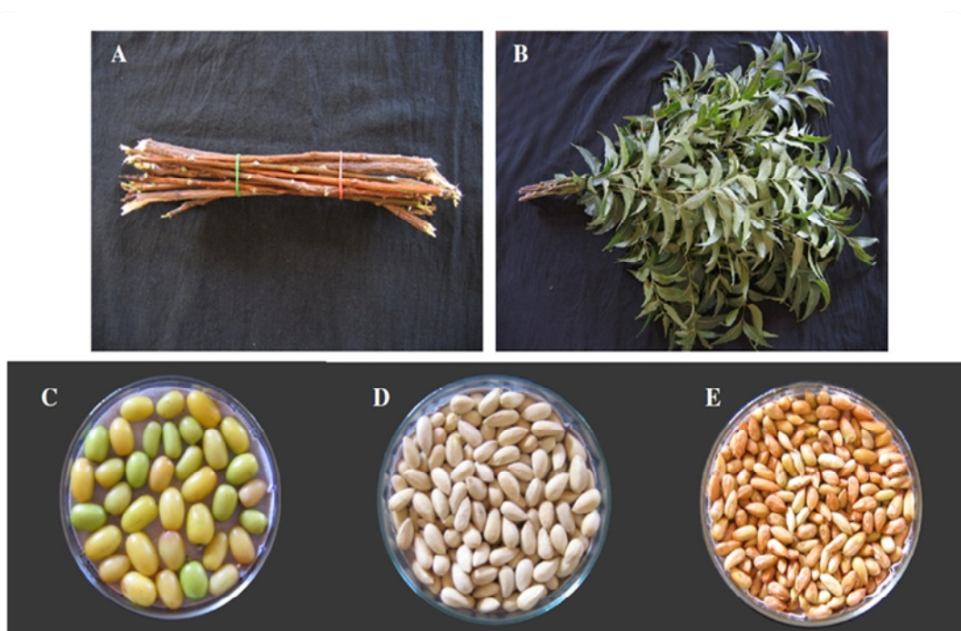
FIGURE-A = Twigs FIGURE-B = Leaves FIGURE-C = Fruits FIGURE-D = Seeds (with endocarp) FIGURE-E = Seeds (without endocarp) 2